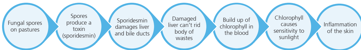
Figure 4. Steps outlining how facial eczema occurs.

There is no cure for FE so prevention is very important. This involves both animal and feed management strategies: